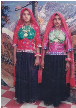
Fig 2: Ahir Women's Clothing 1

She wore a colorful mashroo kachariyo that had 9 panels embroidered in 3 distinct colors on the border, both sides, and top. Her bottom garment was a black ghaghara made of cotton or silk with red tie-dye dots. In the modern day, women produce identical garments with synthetic textures.