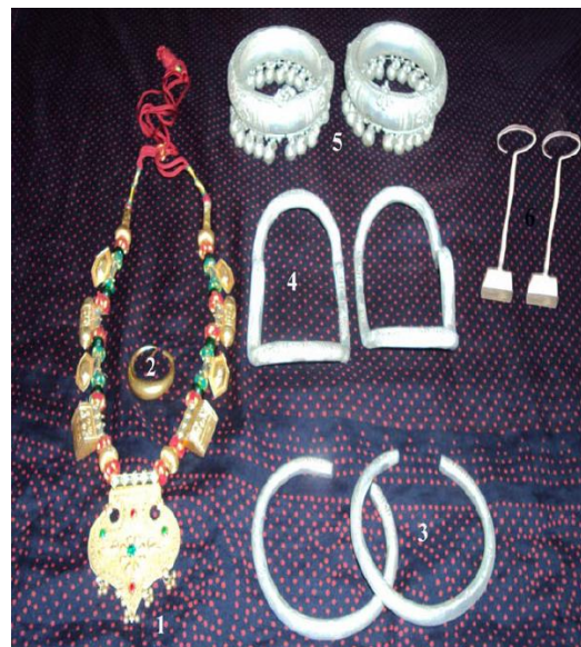
Fig 4: Ahir Women's Jewelry: 1- Ramrani, 2- Vitto, 3- Kadla, 4- Kambi, 5- Zanzar, 6- Vedla

Pandada, valo, and ramrami on the neck. Ivory stud on the left wrist. Silver rings on the fingers. Long vedlas on top of the ears.