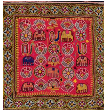
Fig 6: Embroidered Cloth-2

First, the outline is made. Traditionally, a thin stick dipped in natural pigments was used for this. Ballpoint pens, pencils, and charcoal are now just as common. By combining herringbone and buttonhole stitches to create borders or fill in spaces around mirrors, design variations can be created. Ahir believed that mirrors reflected the evil spirit, so they used them a lot. In their embroidery, they mostly used bright, flashy colors like red, blue, yellow, and green to give the barren desert a little life and make people forget about their problems.