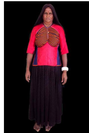
Fig 3: Ahir Women's Clothing 2

The widow used to wear a simple black cotton katvo to cover her head, red sayalis kanchari or cotton and peynu with black color & red dots. In the case that she becomes a young widow, she wore a double-colored kapda, such as blue, maroon, coffee, sky blue, and so on. The present generation also dons garments made of different fabrics but with the same design. They use stitched texture rather than cotton or sadla mashroo, and artificial texture like polyester..