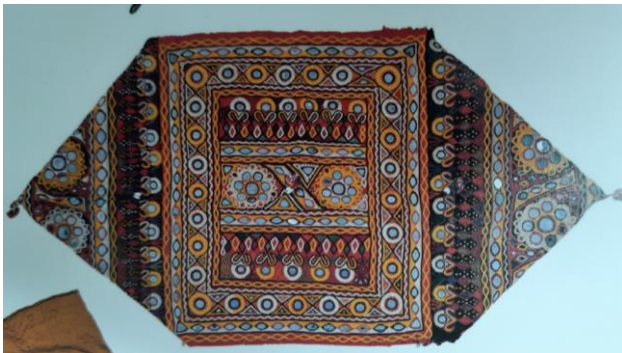
Fig 5: Embroidered Cloth-1

The sankdi, or chain join, is then worked over the diagram, trailed by the vaano, or herringbone line, as filler, and the bakhiyo, or back fasten, or the daano, or single unit of the chain fasten, as a highlighter. The work is given the appearance that is frequently associated with embroidery from this region of the world by using aablas, or mirrors.